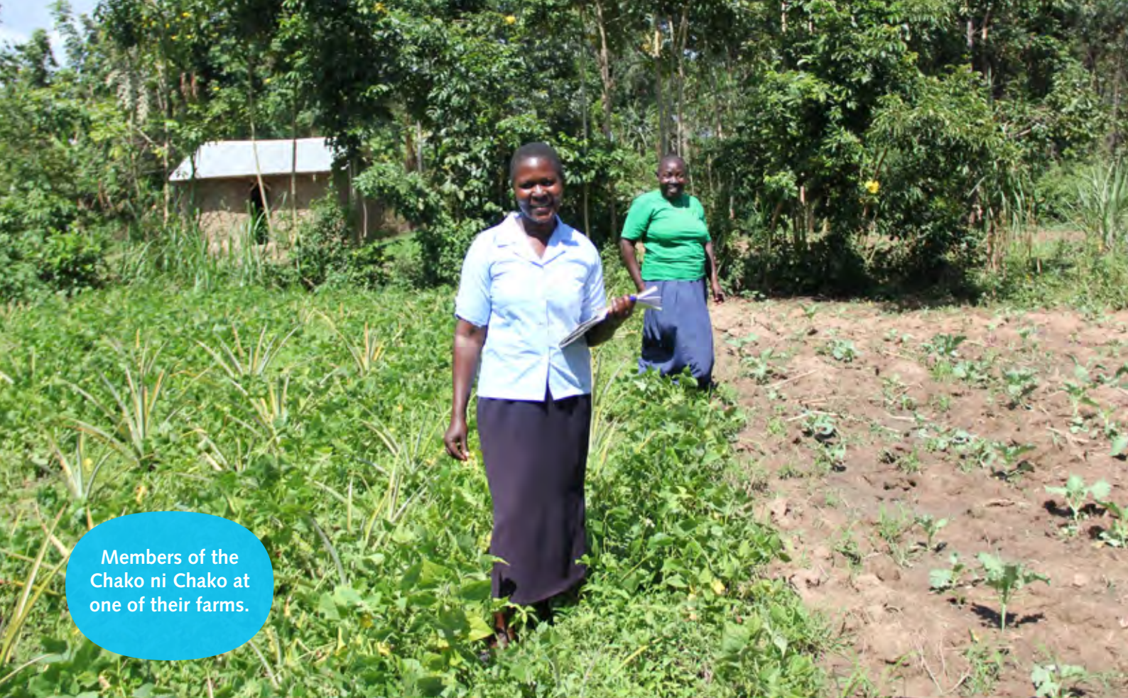
Members of the Chako ni Chako at one of their farms.

The farmers are no longer reliant on only maize and have other foods to supplement including the Soybean and they hope that the county government will continue to improve policies so they can get better markets and favorable prices for their farm produce.